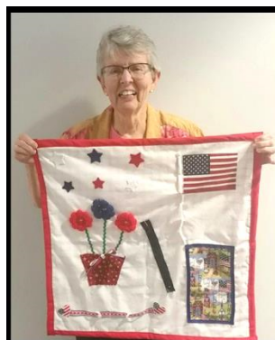
Alzheimer Activity Mat