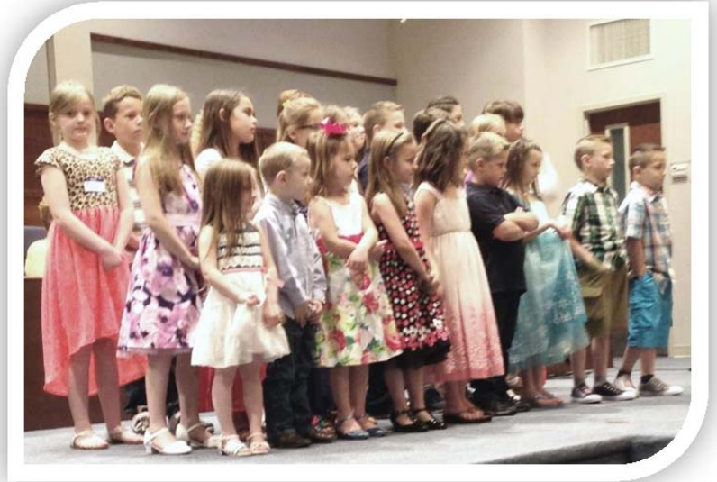
Our PHBC Children Singing in Easter Service

On May 17 th we will kick off our Wednesday night summer program. I need at least five pairs of volunteers (either couples or two women or two men) who would be willing to teach our church during the 6:30-7:30 time. All materials will be provided. Lessons are all ready to distribute to those who are willing to teach during the summer so our teachers who teach on Wednesday during the school year can be fed. The subject will be lessons on the Lord's Prayer and how to pray. We will not be feeding children during this time.